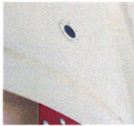
Sight Glass Level Indicator