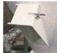
8x8 Poke Hole