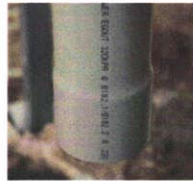
6" PVC Vent Pipe