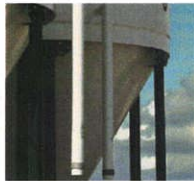
4" Fill Pipe